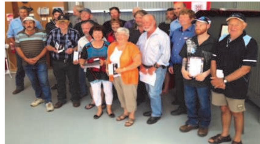
Bendoc Service Award recipients are pictured above, these awards were not given last year and awarded on the day.