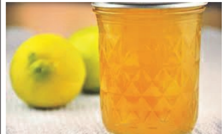
****Makes approximately 4 jars****

Mix in the citrus juices, measure and return to pan. Add 450g of sugar for every 600ml of juice, bring to the oil and cook until setting point is reached. Remove from heat, pour into warm, sterilised jars and seal.