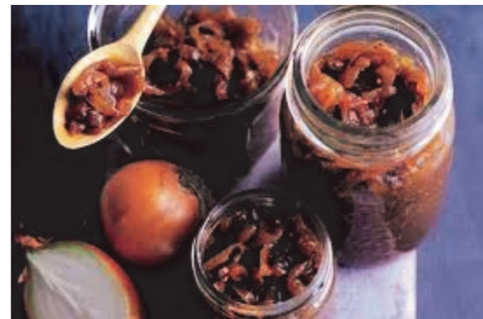
****Makes approximately 6 jars****

This is lovely served on homemade hamburgers, steak, chops...anything!!!