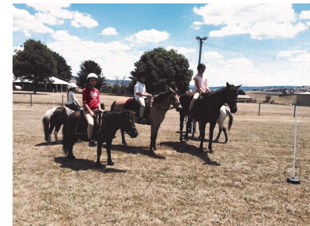
The keen group of riders!