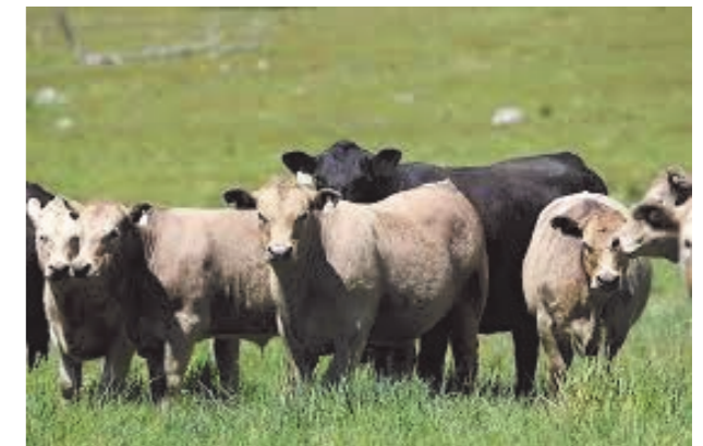
Pictured above: Some of Rangan Charolais Stud's 'Silver Calves'.

Plants will appreciate a feed at this time of year—a seaweed tea or liquid fertiliser would be perfect!