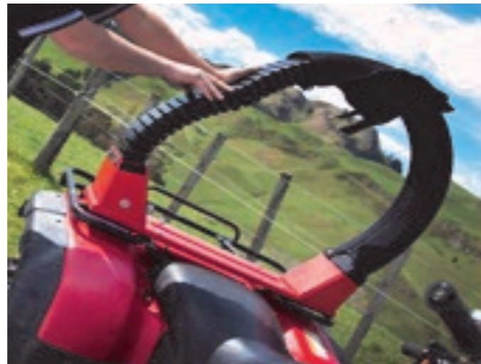
PICTURED ABOVE IS THE LIFEGUARD™ FITTED TO A QUAD.

Please note that there are a variety of other rollbars on the market—it is all personal preference. I just thought it was noteworthy to mention this little gem.