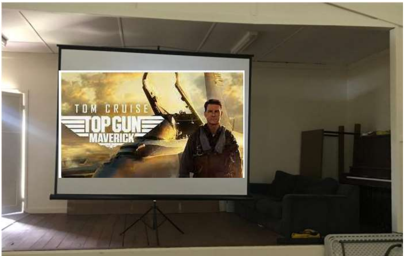
Above: The new movie screen at the Bendoc Hall

We would also like to thank all the community members who came along, supported us, and helped out on the night. With some luck, we can make the Bendoc movie night a regular occurrence. More photos on page 5.