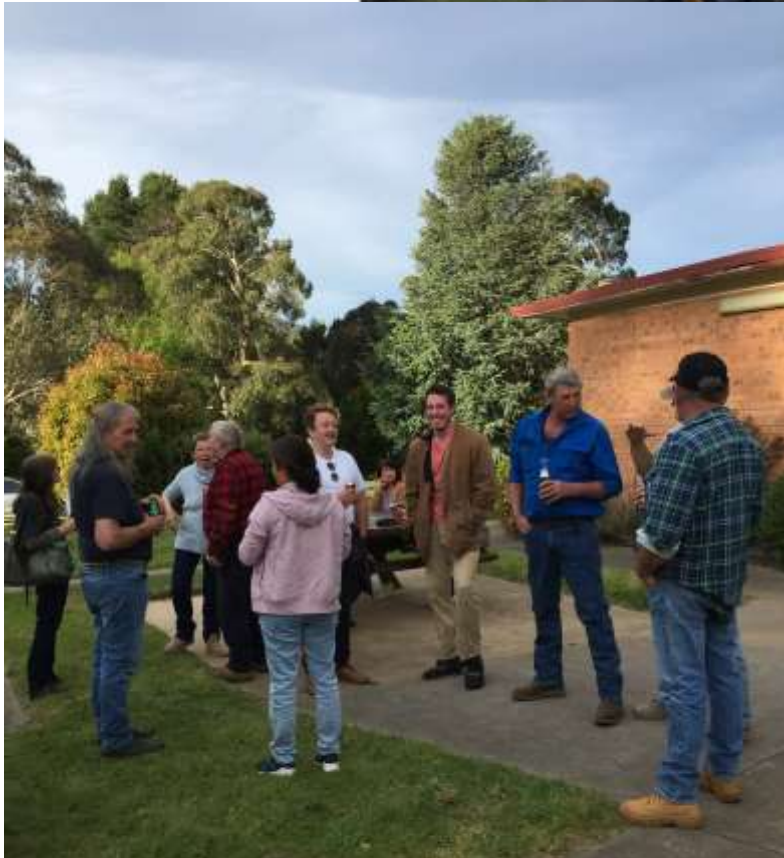
Above, left & below right: Photos from the Bendoc Movie night and dinner.