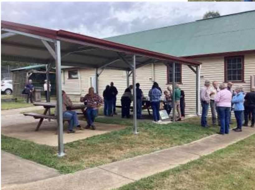
Morning tea and lunch was catered for by the Bendoc Progress Association which attendees enjoyed under the new facilities at the Bendoc Hall. (Above and left)