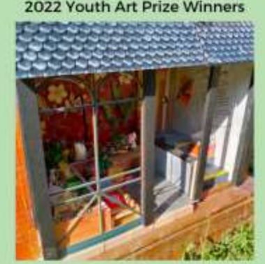
Escape of the Arty Loft - Christy Lanyon