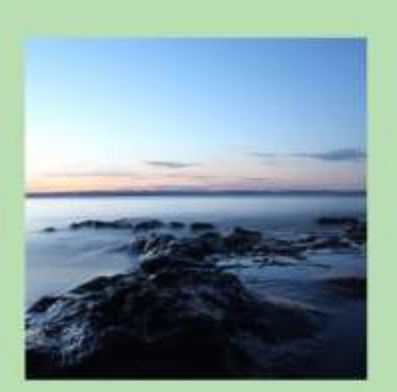
Dreams - Imrahn Canary

Artworks can include drawings, paintings, photographs, digital illustrations or 3D visuals and short 2–3 minute films. Photographs of larger physical works will be accepted