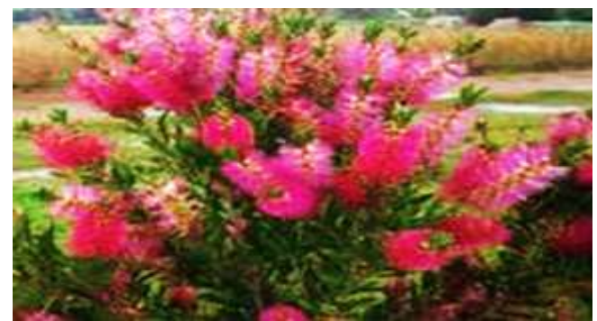
JOBS FOR THIS TIME OF THE YEAR Start weeding before they get out of control Finish off any winter pruning & straggly bits

Plant in full sun to semi-shade. It has good frost and drought tolerance once established.