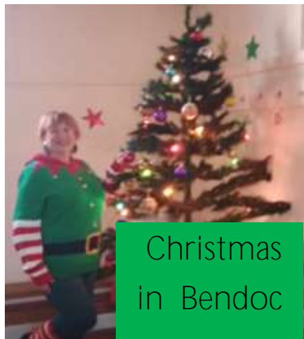
Christmas in Bendoc

bendocpa@bigpond.com 02 64581531 Bendoc.org.au