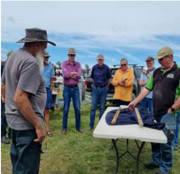
Soil testing last year

Another Farm/Field information Day in Bendoc is planned to be held soon. Sorry we have no definite dates at time of printing.