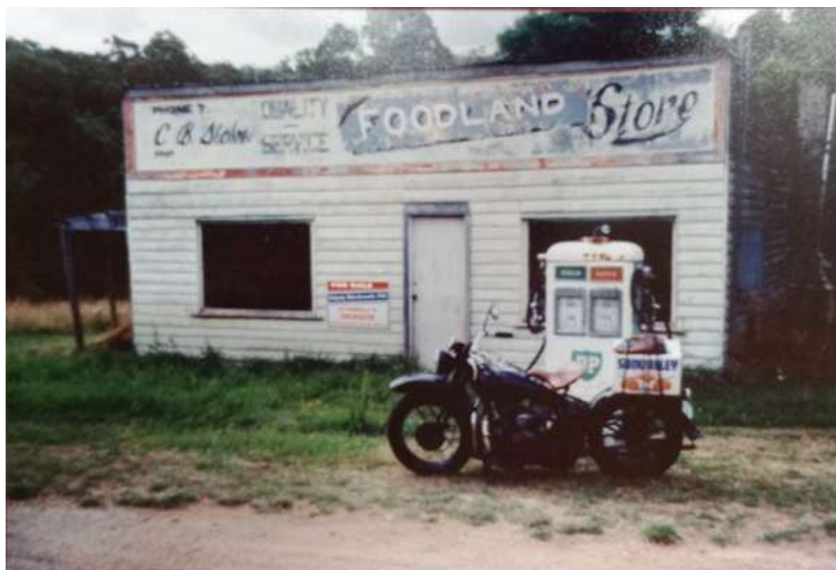
Yesteryear snap— the old bowser at Bendoc. It may be difficult to pick, but any guesses as to who's bike?