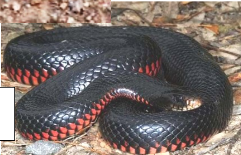
Red bellied Black – Less venomous than the other 3 and generally less aggressive. Can be found in woodlands, fields & around your home. They like water & can look like a black stick in a dam. They give birth to young in membranous sacs & emerge shortly after birth.

Info from wildsoutheast.wordpress & hodgsonsnakes@gmail.com