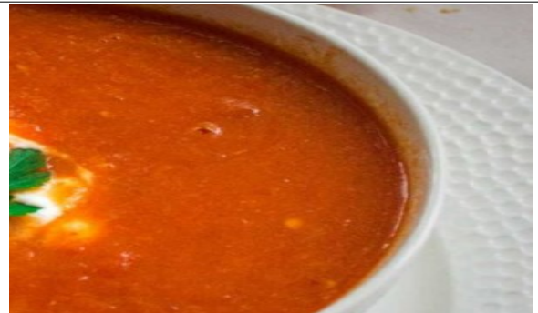
Serve with sour cream & green garnish

3 red capsicums 2 leeks 500 grams roma tomatoes 1 Tbsp tomato puree 800 mls chicken or vegetable stock - or half & half Salt & pepper 1 clove garlic Lightly oil roasting tray, spread out tomatoes, capsicum & leeks, drizzle oil on top & roast in preheated oven at 200 C. for 15 or 20 minutes