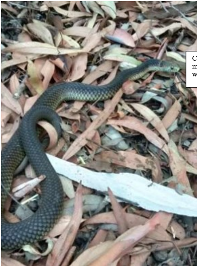
Copperheads are black or dark grey, with orange, gold or cream underbelly. Around a metre to 1.5 metres. They like to stay near water & they give birth to live young. They will eat frogs, lizards & grasshoppers & tiger snakes

A brief First Aid Reminder— Patient to keep still, lying down Call 000 Bandage firmly (elasticised if available) starting from fingers or toes –upwards as far as possible covering bite area Use a splint, mark bite spot Use CPR if no breathing