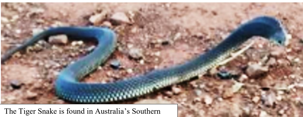
The Tiger Snake is found in Australia's Southern states. Some have black & yellow stripes, others can be black or brown, this can also change with seasons. They are typically 1.2 metres long. They hang around water, don't lay eggs & can give birth to up to 30 young in summer