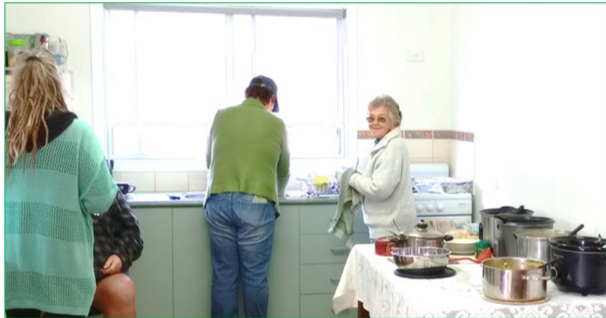
Soups on offer & ready to go- Moorish Mushroom, Perfect Pumpkin, Zesty Zucchini & Green Pea, Beautiful Beef & Barley, Velvety Vegetable & Comforting Chicken & Corn

Celebrating Neighbourhood & Community Centres Week 10-17th May. On a perfect Sunday, close to 30 Soup Sippers gathered at Bendoc Neighbourhood House & enjoyed helpings of homemade delicious soup, snacks & great company