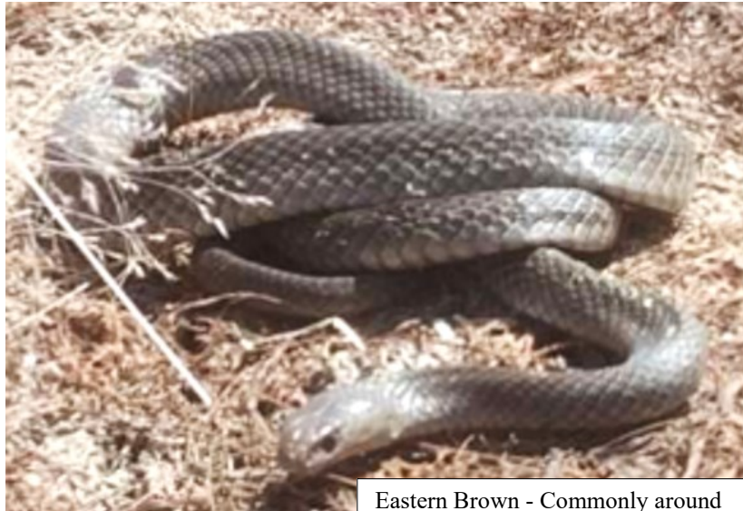
Eastern Brown - Commonly around 1.5 metres, can get to 2.6. They like house mice to eat & are responsible for 60% of Australia's snake bite deaths. They are usually light brown but can be greyish or even black with a cream or yellow belly. Juveniles have a black head & brown body. Eggs can be found in places like rabbit burrows & tree stumps